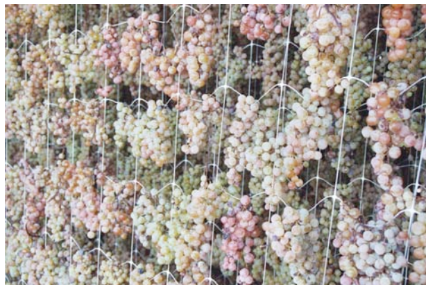
Garganega grapes hanging to dry for Recioto di Soave at Coffele

Coffele owns 30 hectares (74 acres) of vineyards in the hills near the town of Monteforte in the heart of the Soave Classico zone. The Garganega fruit from this location is prized for its ripeness and fine natural acidity. (Continued on Page 2)