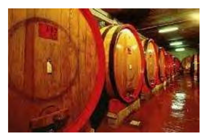
Above: Wooden casks are used for the aging of both the Rosso and the Brunello di Montalcino of the Cantina Below: The Cantina di Montalcino follows a viticulture that is extremely environment-friendly. Only natural fertilizers are used, and pesticides or fungicides are cautiously used only when absolutely necessary.