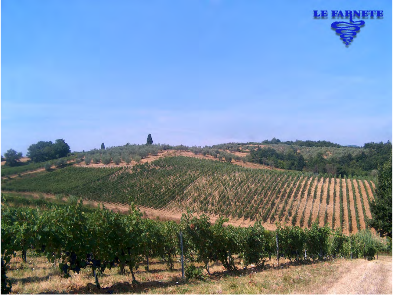
Tenuta LE FARNETE