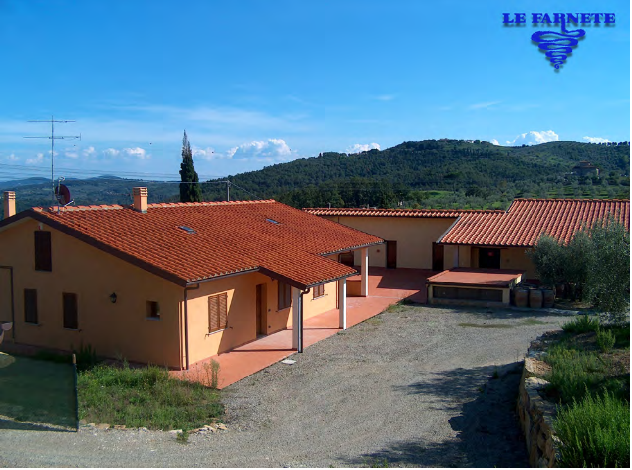
Tenuta LE FARNETE